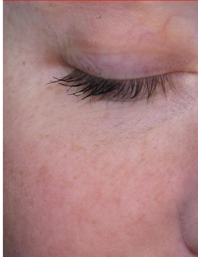
AFTER 90 DAYS USAGE

Dramatic fading in sunspots on cheek area. Healed Rosacea in nose area.